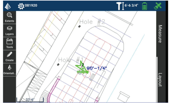
Bring CAD files to the field in .dwg or .dxf format

Founded in 1983, Carlson Software Inc. specializes in CAD design software, field data collection, laser measurement and machine control products for the civil engineering, surveying, GIS, construction, and mining industries worldwide. Carlson is proud to provide one-source technology solutions for the entire project cycle.