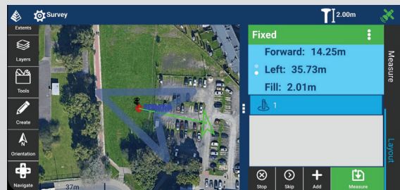
Easily navigate to stakeout points