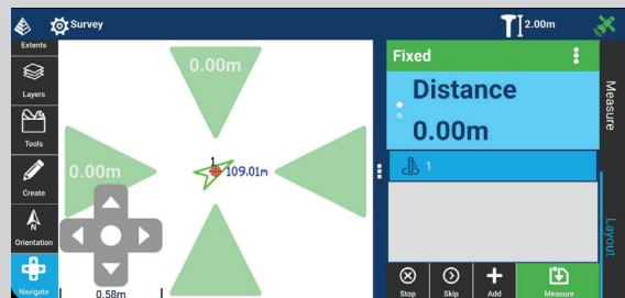
Sub-meter guides provide fast, precise staking